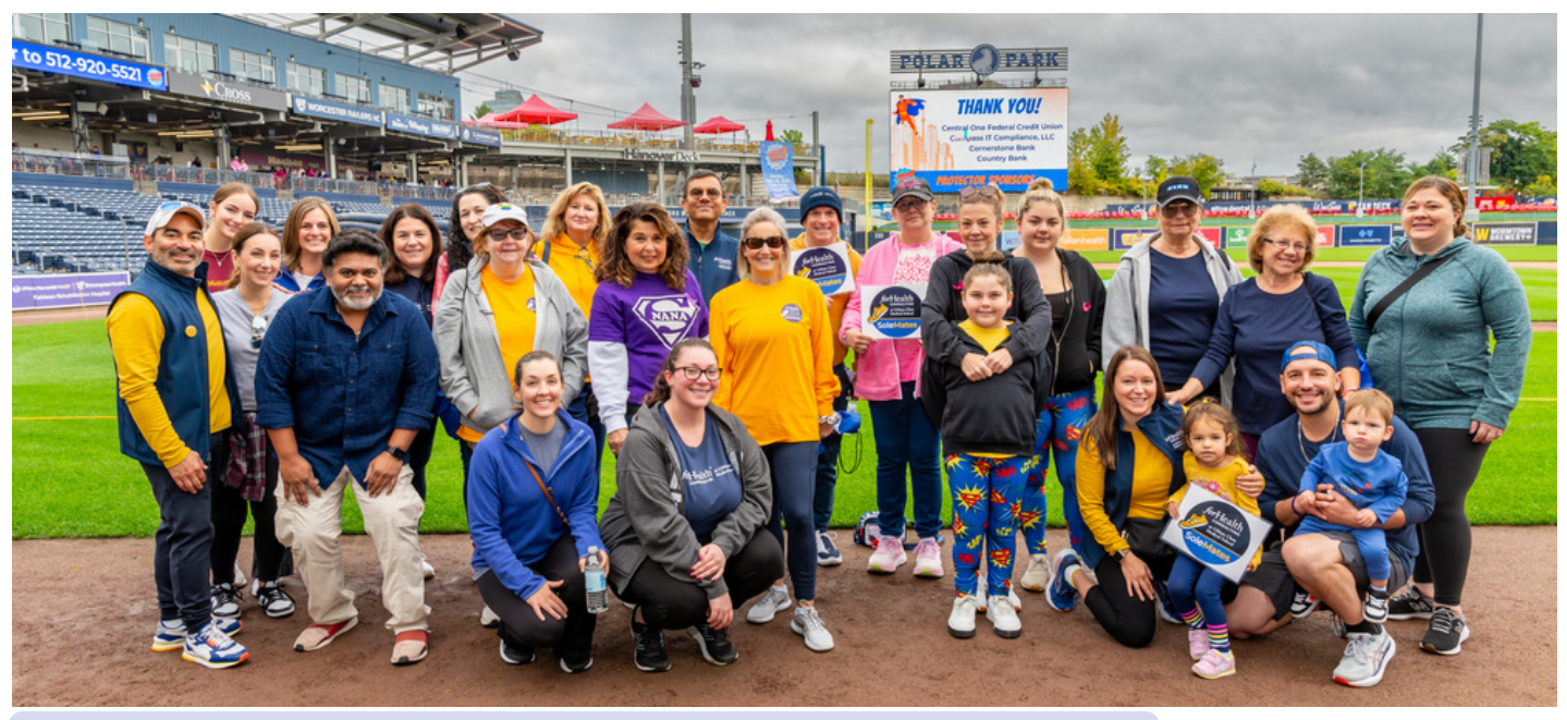
Team ForHealth SoleMates from the 2024 UMass Cancer Walk.

In becoming a Team Leader for the UMass Cancer Walk, you are leading by example. Your commitment to support this event makes you a vital partner to the researchers and physician-scientists at our UMass Cancer Center—because your efforts enable them to focus on critical research, including clinical trials, that have the potential to change the lives of those with cancer. In other words, you are helping us to develop the very best therapies, as well as to discover new treatments and deliver them to patients. And in doing so, you are providing hope to those who need it most. We are extremely grateful for your efforts and we thank you, from the bottom of our hearts, for your support.